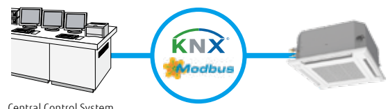
Central Control System

Centralized control including facilities and equipment in addition to air conditioning is possible by linking up with MODBUS, KNX interfaces.