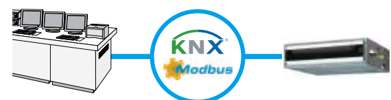
Central Control System

Centralized control including facilities and equipment in addition to air conditioning is possible by linking up with MODBUS, KNX interfaces.